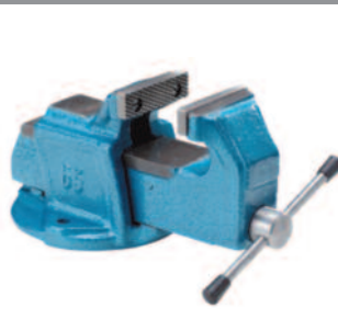
TABLE VISE WITH ANVIL