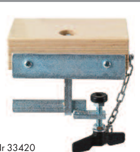
TABLE VISE HOLDER