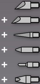
SOLDERINGTIP-SET Ord.-Nr.: 20159