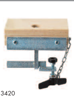
TABLE VISE HOLDER