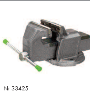
TABLE VISE WITH ANVIL